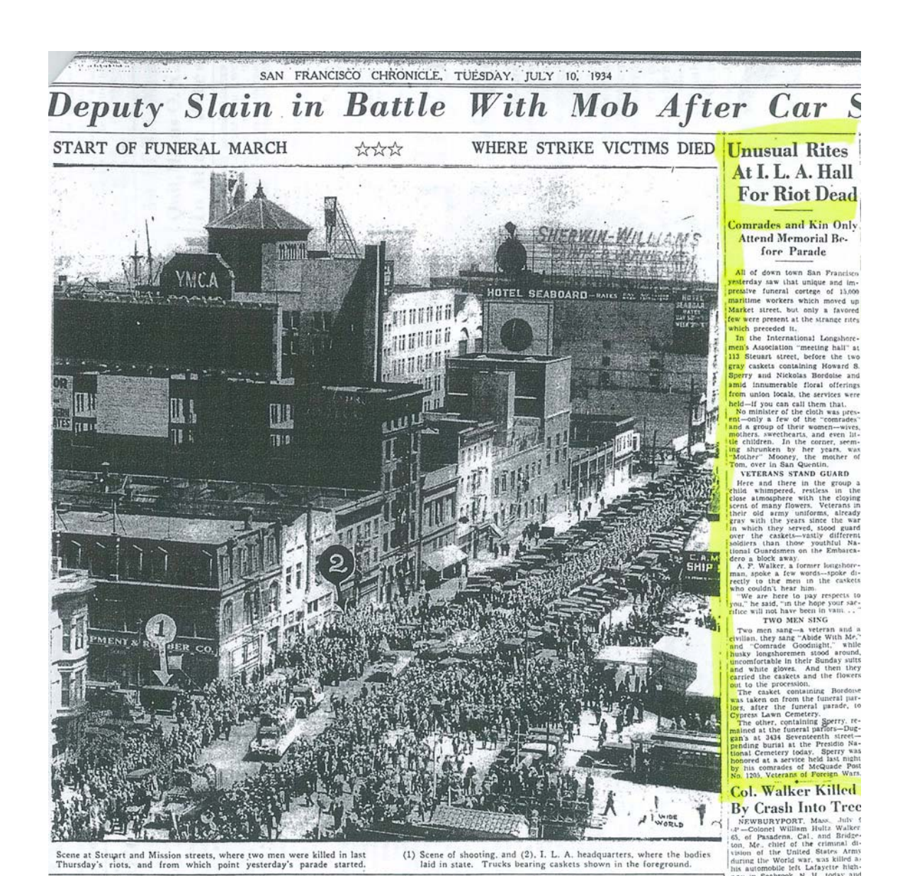
San Francisco Chronicle, Tuesday, July 10, 1934

15,000 at Strikers' Funeral as Peace Parleys Start