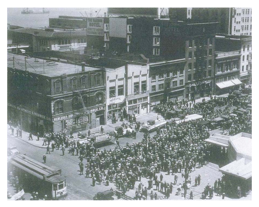
Funeral Preparations, Morning, July 9, 1934, 113 Steuart St., flatbed trucks to carry caskets being prepared