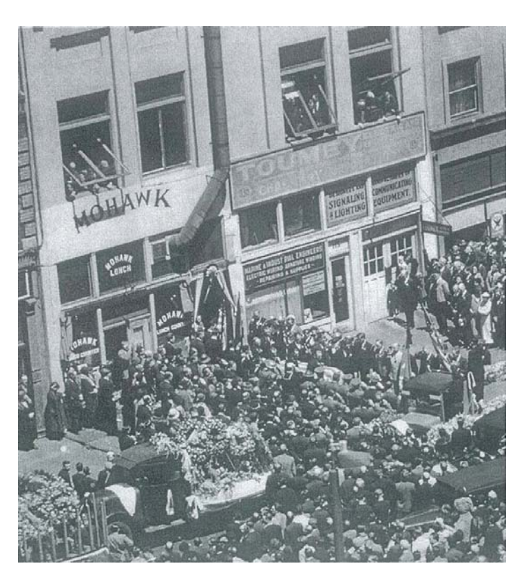
Noon, July 9, 1934, Spectators looking down from inside the ILA Headquarters while the flag draped caskets are moved to the truck from the draped entry.